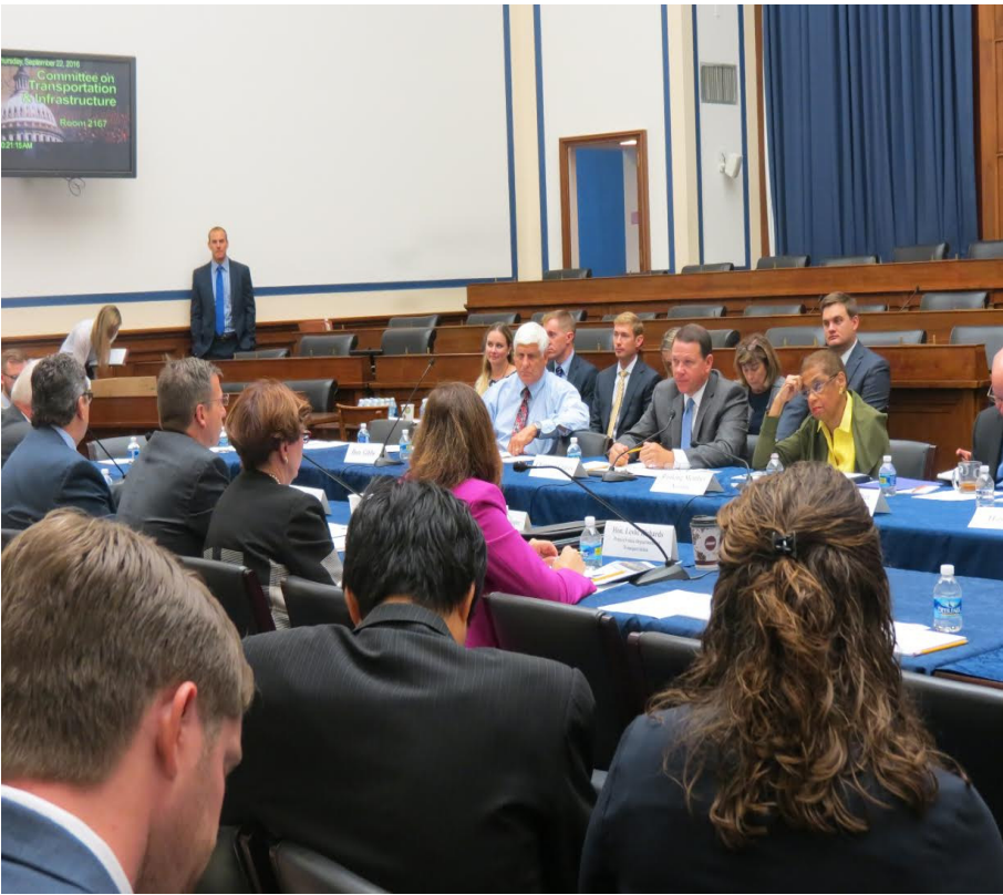
Pictured above is where the Leadership Conference at William Jewell was held