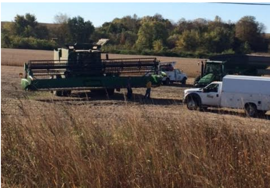
Pictured above are combines and tractors harvesting their carefully planted fields.

So, the next time you sit down to a delicious meal with fresh meat and vegetables, be sure to take time to thank those who provided you with food.