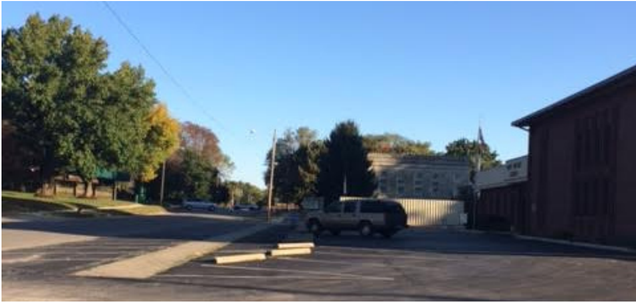
Looking north down Hudson Street, location where Trunk and Treat will be held on October 31, 2016. All are welcome!

If you are looking for a safe, fun place to take your kids on October 31, 2016 for trick or treating, look no further. From 5 pm-6:30 pm Hudson Street near downtown Buckner you will have an exciting, fun and safe place to take the kids for excellent treats and a fun and safe environment. Individuals will open the trunks of their cars and some businesses, plus churches will offer great treats for the children. You will have a great opportunity to take the kids for a fantastic evening. Please bring sacks, baskets, bag, etc. to put your goodies in and wear a great costume. It's a fun time for the kids and adults alike. They will get to see their classmates, enjoy looking at all the amazing costumes. Please mark your calenders for October 31, 2016 at 5:00-6:30 pm. See you there!