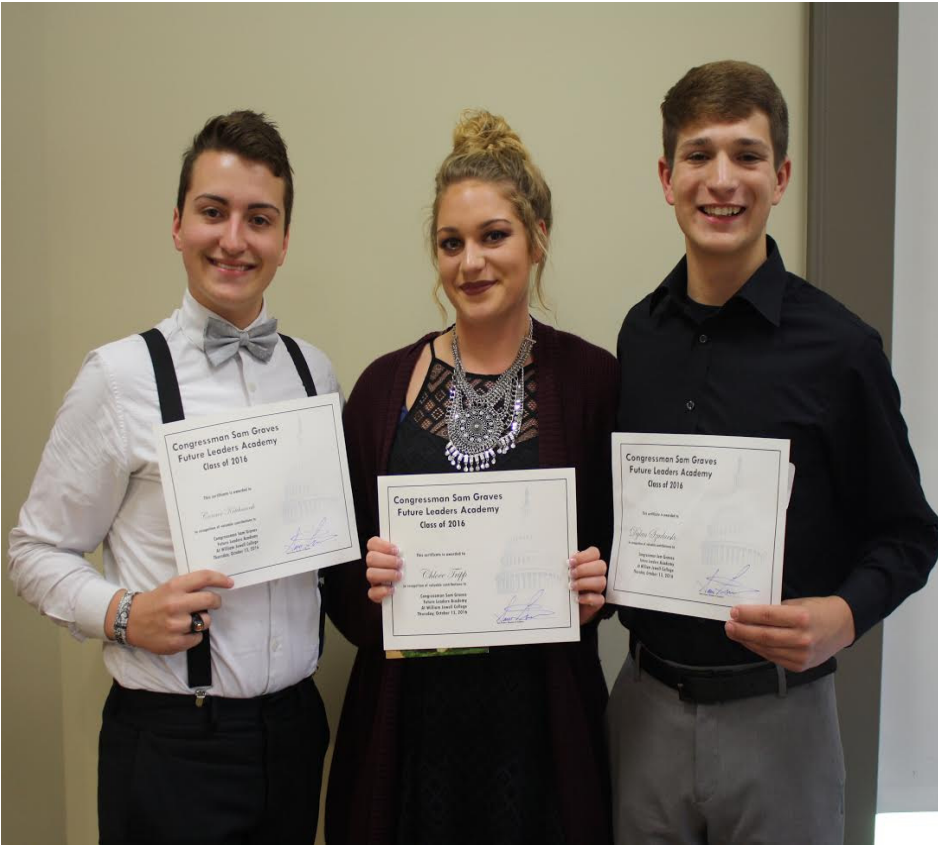
Pictured above are some students from Oak Grove high school who attended the event for Future Leaders in Our Communities