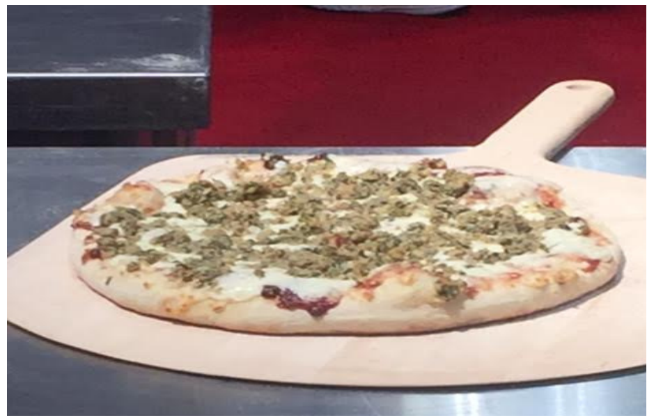
Pictured above top to bottom: Kirk Kellough at the International Pizza Challenge in Las Vegas, Kirk's chicken, spinach, figs and 4 different cheese pizza.