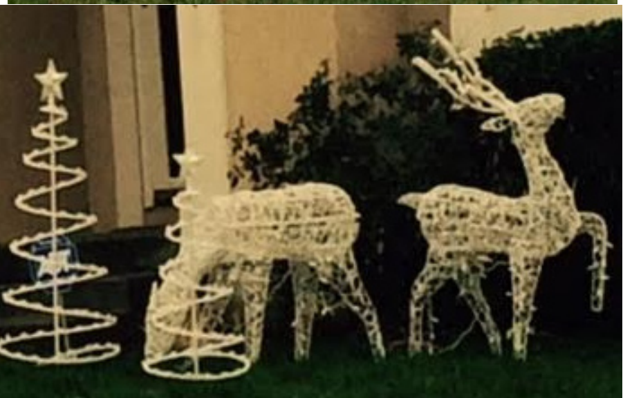
Please take time to drive around our communities and enjoy all the amazing decorations!