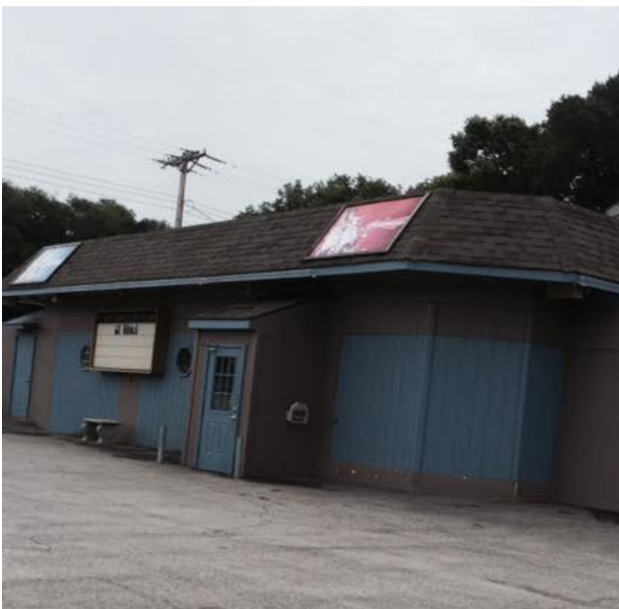
Pictured above is Tommy G's Pub and Grill

Tommy G's offers a variety of food items and specials. They serve great food at affordable prices. Please help support your local businesses. Please see Ad on page 4 for Tommy G's Menu. Welcome to the Buckner business community!