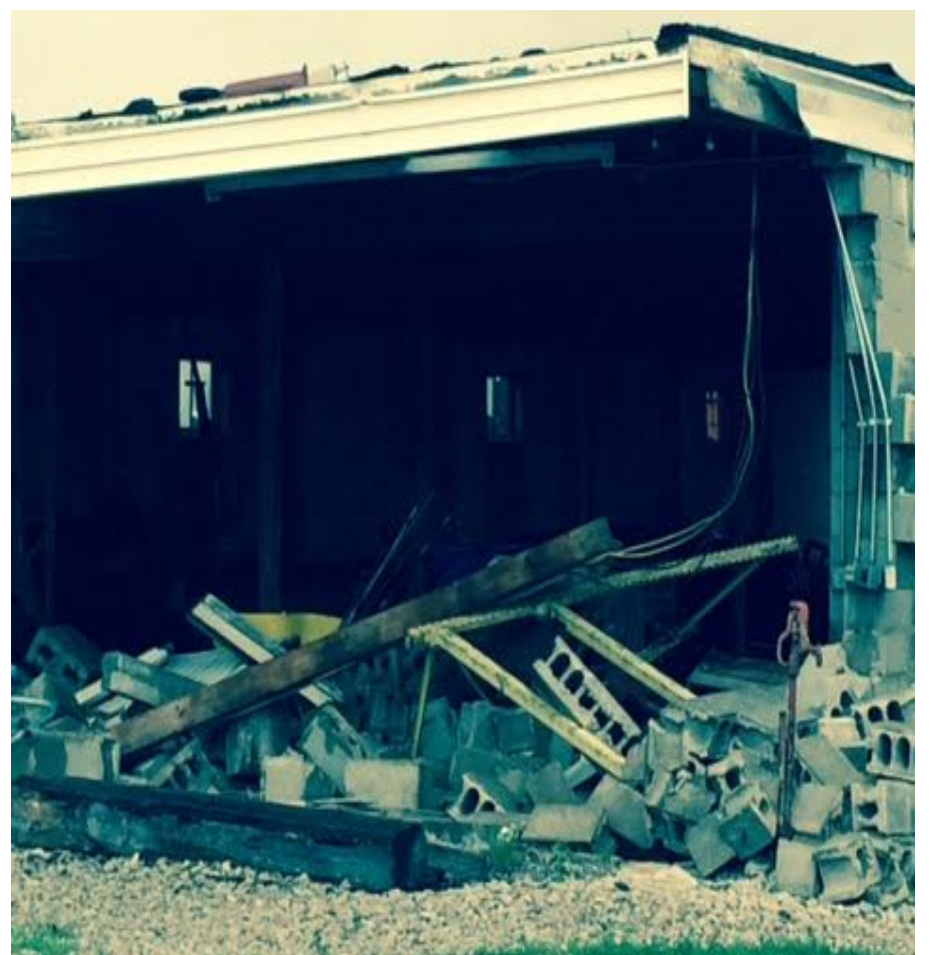
Pictured above is just some of the damage caused by the tornado last month at AAA Disposal Company.