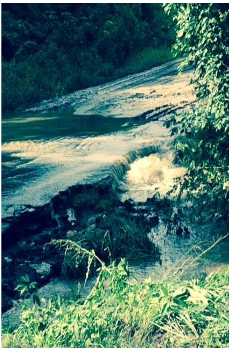
Pictured above is Holly Road at the intersection of Holly and Neil Chiles road after the last rain. You can see that the road is slowly deteriorating and becoming dangerous.

One of the ball fields in Heisler-Burns Park was partially under water and the top of the fence was barely showing. Trees fell down, some landed on vehicles others went through windows