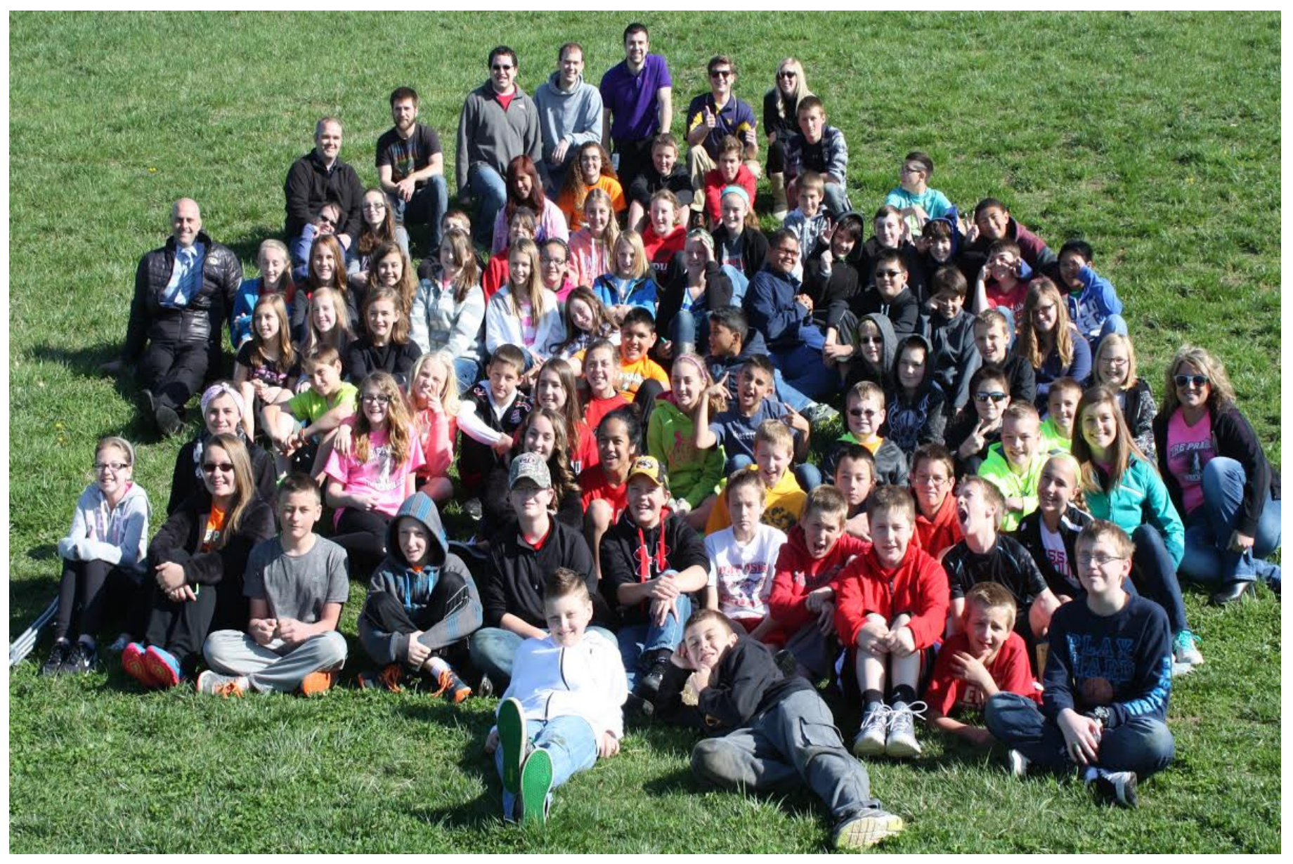
Teachers, students, patents and engineers are excited about the Space Balloon Launch!