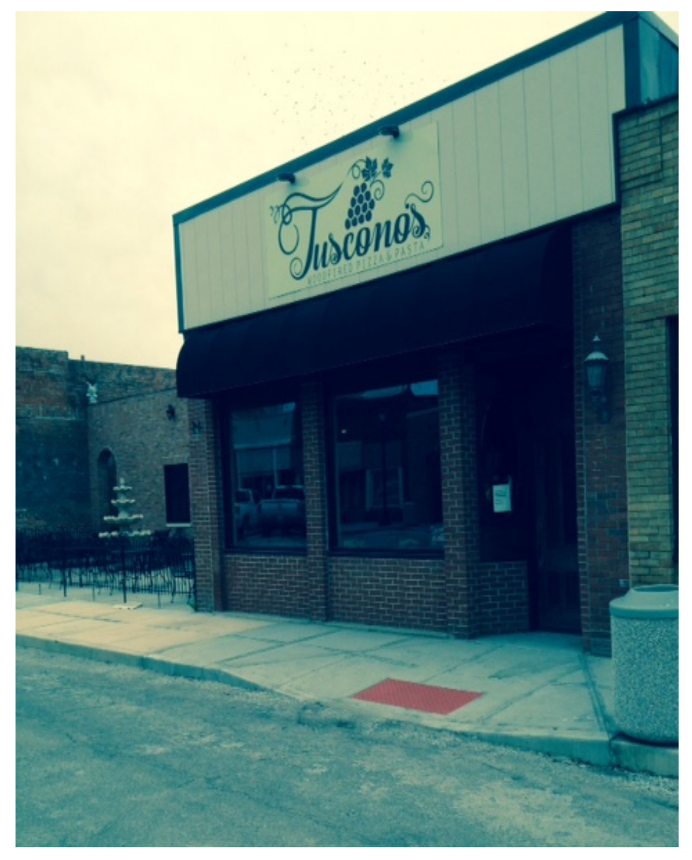
Tusconos Italian restaurant opening soon in downtown Buckner! Indoor and outdoor dining, plus wonderful authentic Italian food and brick oven pizza's among many delicious menu items!

Please visit us on the web 24/7 at www.gazetteweekly.com