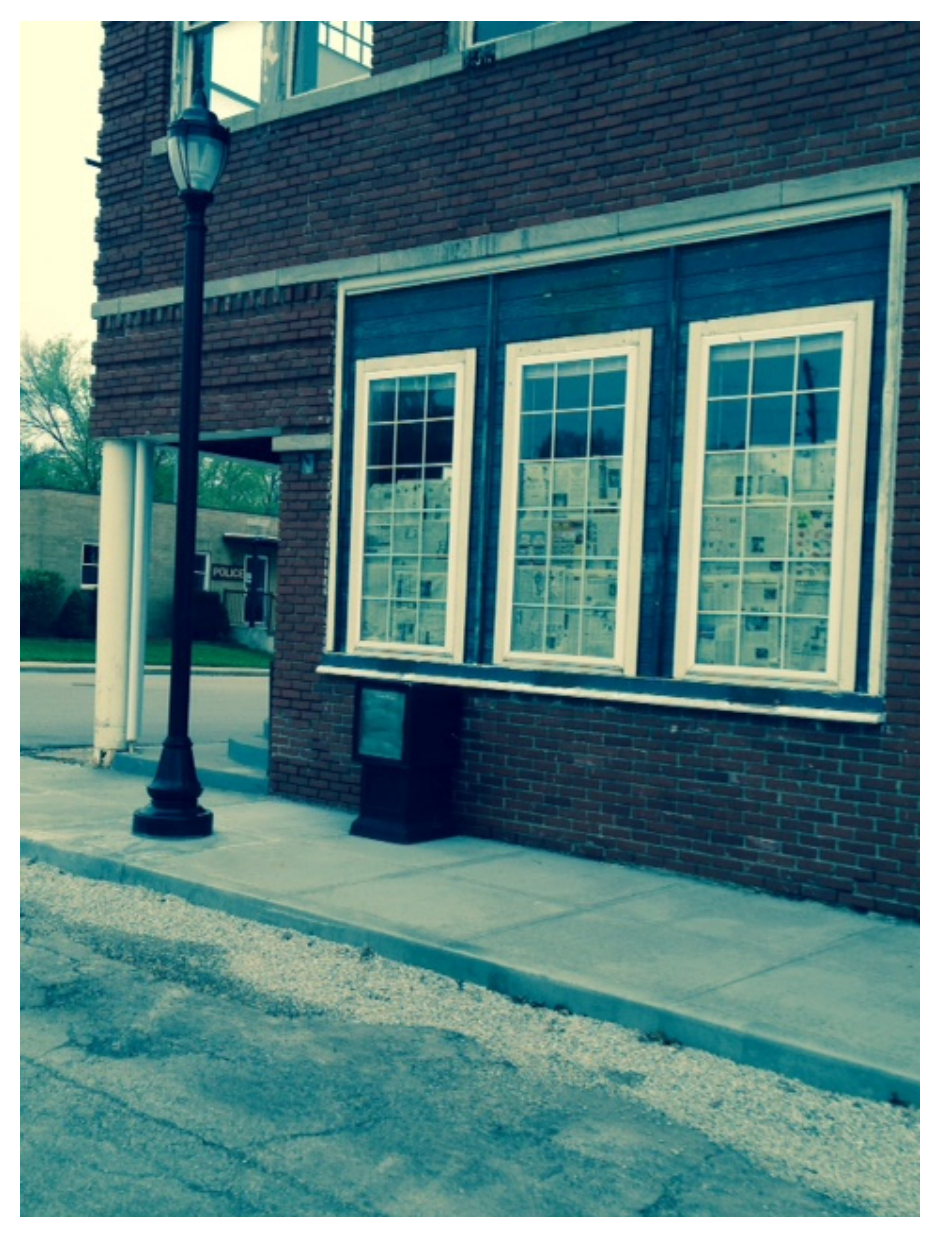
What new business in downtown Buckner is behind windows number one, two and three. Only time will tell!