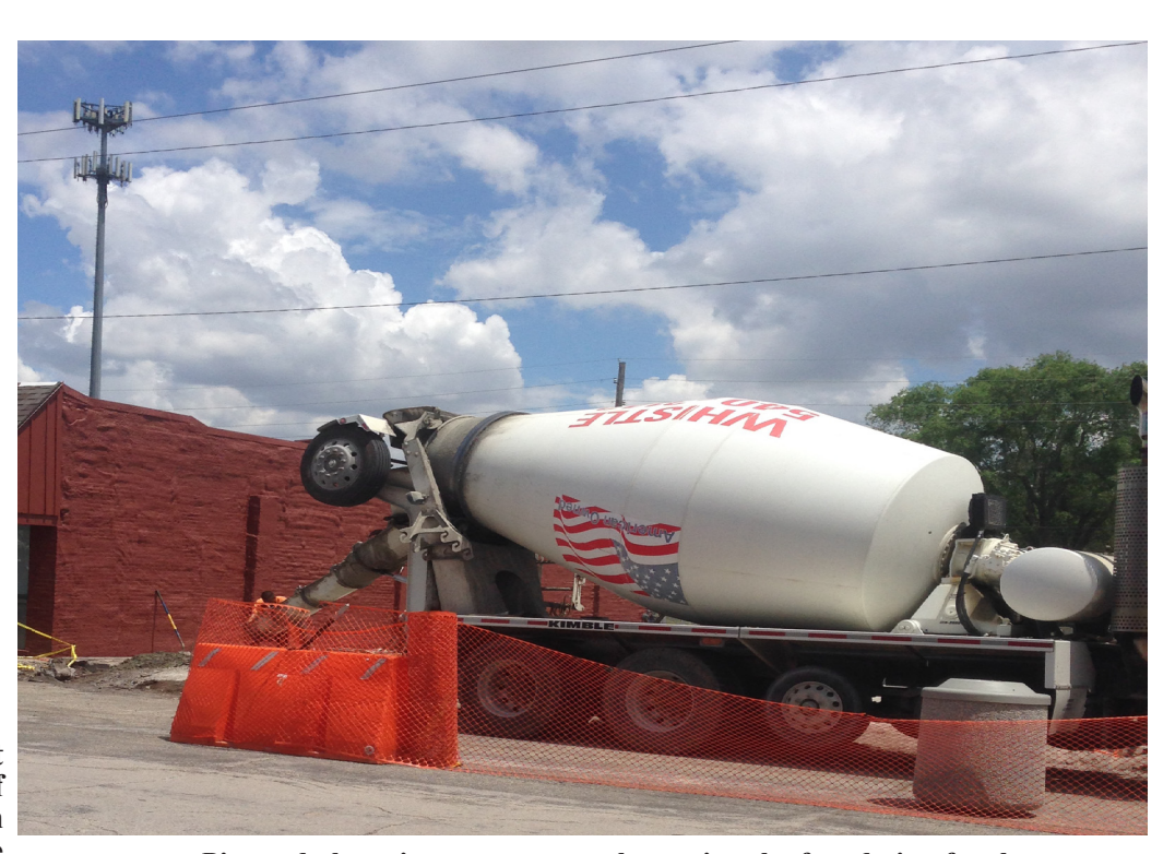
Pictured above is a concrete truck pouring the foundation for the new Buckner City Hall, located on Hudson Street in downtown Buckner. Thanks Kirk for the picture, paychecks in the mail!