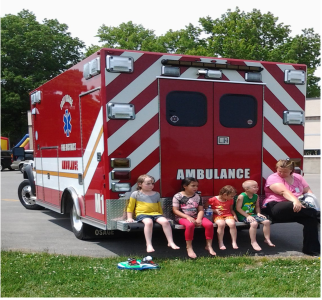
Some children taking a break by the FOFPD ambulance after being sprayed!