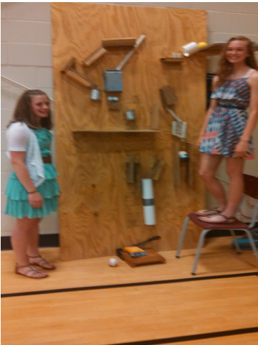
Science Fair Project